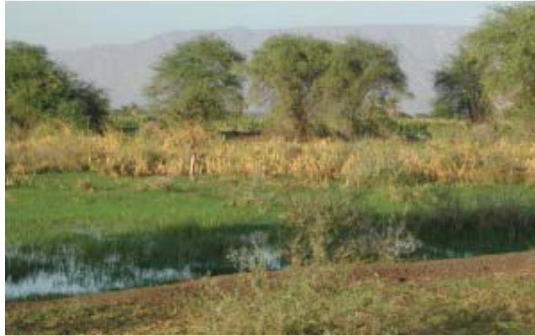
Suitable area for mosquito breeding in the Afar region of Ethiopia