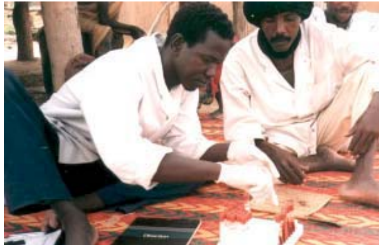
Sentinel herd monitoring by a field agent in Mauritania