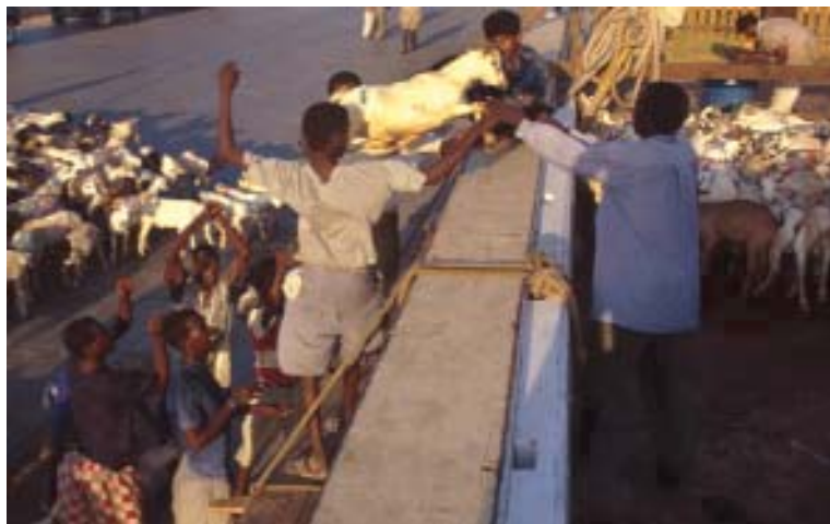
Trade of livestock between the Horn of Africa and the Arabian Peninsula (Port of Berbera, northern Somalia)

should be similar. More emphasis should be placed on the importance of doing the “right thing”, about sourcing animals from disease-free areas where possible; not buying any sick stock; and following any rules about quarantine, vaccination, testing or identification of animals. The potential consequences of the occurrence of a disease for internal and international trade should be emphasized.