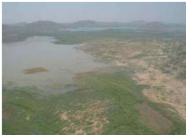
Typical swamp area susceptible to mosquito breeding

RVF, however, has the potential for further international spread, particularly with the climatic changes that might be expected with global warming. High-risk receptive areas are, for example, the