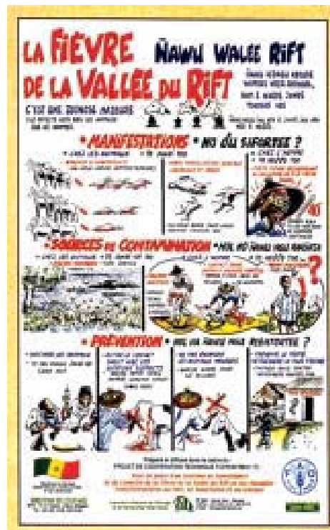
RVF public awareness poster produced in Senegal